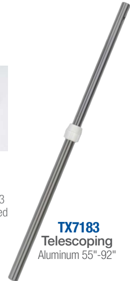
TX7183 Telescoping Aluminum 55"-92"