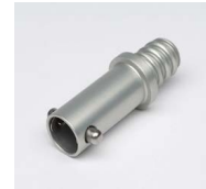
TX10217 TexConnect™ Adapter For use with TX7183 to attach screw-based mop heads.